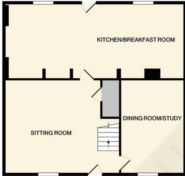
GROUND FLOOR APPROX. FLOOR AREA 721 SQ.FT. (67.0 SQ.M.)